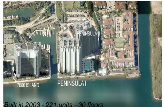
Built in 2003 - 221 units - 30 floors