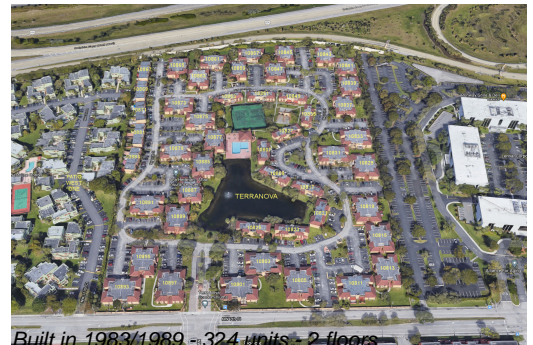
Built in 1983/1989 - 324 units - 2 floors