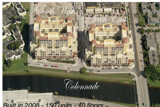
Built in 2008 - 150 units - 10 floors