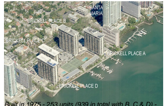
Built in 1975 - 253 units (939 in total with B, C & D) - 23 floors