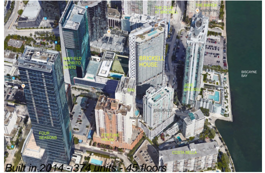
Built in 2014 - 374 units - 45 floors