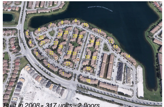
Built in 2008 - 317 units - 2 floors