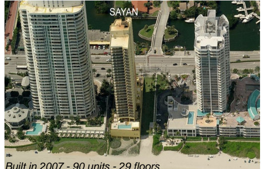
Built in 2007 - 90 units - 29 floors