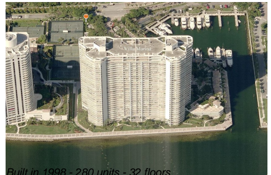
Built in 1998 - 280 units - 32 floors