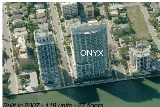
Built in 2007 - 118 units - 27 floors