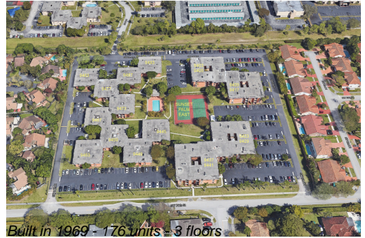
Built in 1969 - 176 units - 3 floors