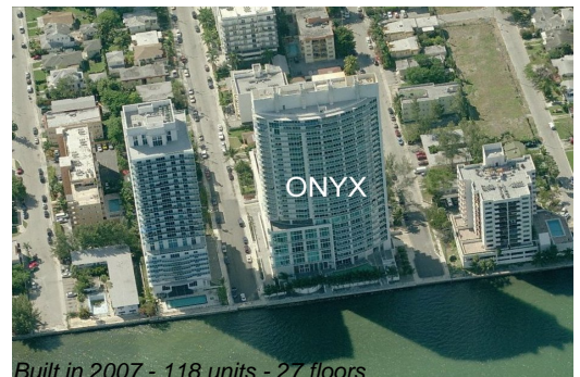
Built in 2007 - 118 units - 27 floors