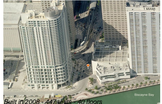
Built in 2008 - 447 Units - 40 floors

The above valuated price is a baseline figure that does not take into account any specific renovation, upgrade, split, merge, or deterioration of the unit.