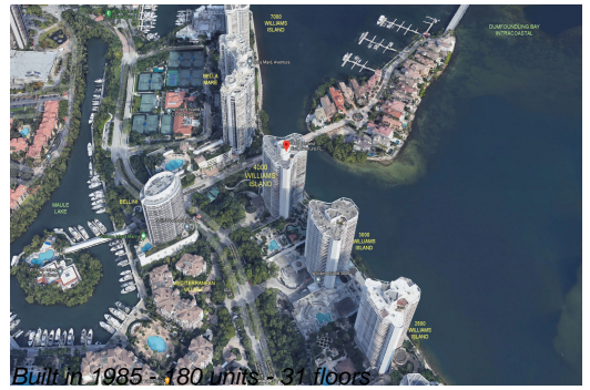
Built in 1985 - 180 units - 31 floors

The above valuated price is a baseline figure that does not take into account any specific renovation, upgrade, split, merge, or deterioration of the unit.