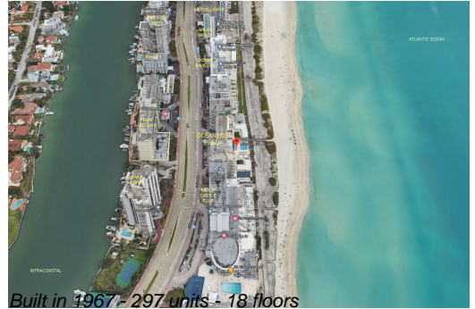
Built in 1967 - 297 units - 18 floors

MLS Number: A11544646 Status: Active Size: 906 Sq ft. Bedrooms: 1 Full Bathrooms: 1 Half Bathrooms: 1 Parking Spaces: 1 Space,Assigned Parking,Covered Parking View: List Price: $575,000 List PPSF: $635 Valuated Price: $536,000 Valuated PPSF: $592