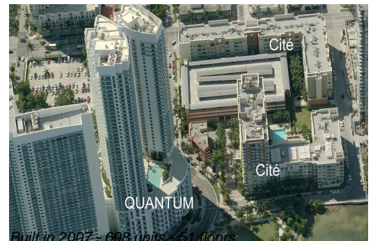
Built in 2007 - 696 units / 51 floors