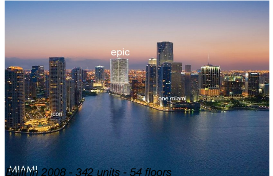
MIAMI: 2008 - 342 units - 54 floors