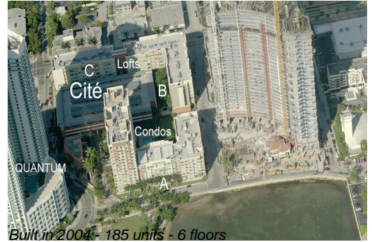
Built in 2004 - 185 units - 6 floors