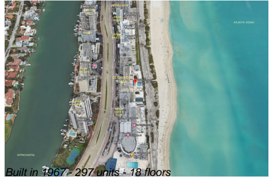
Built in 1967 - 297 units - 18 floors