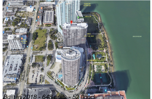
Built in 2018 - 648 units - 52 floors