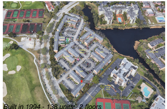
Built in 1994 - 138 units - 2 floors