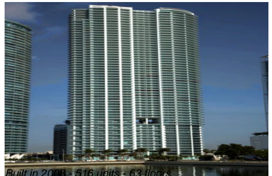
Built in 2008 - 516 units - 63 floors