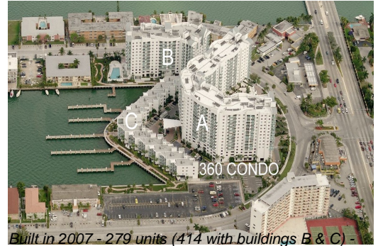
Built in 2007 - 279 units (414 with buildings B & C) - 15 floors