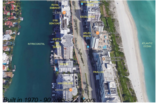
Built in 1970 - 90 units, 22 floors