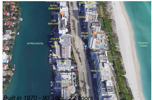
Built in 1970 - 90 units, 22 floors