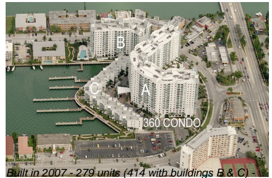
Built in 2007 - 279 units (414 with buildings B & C) - 15 floors