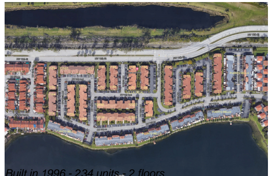
Built in 1996 - 234 units - 2 floors