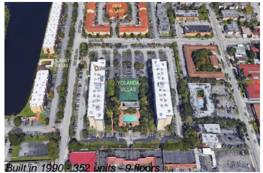
Built in 1990 - 352 units - 9 floors