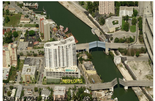
Built in 2004 - 199 units - 20 floors