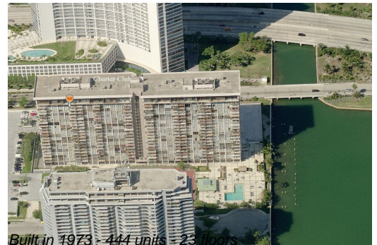
Built in 1973 - 444 units - 23