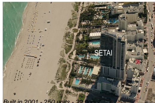
Built in 2001 - 250 units - 39 floors