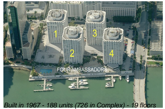
Built in 1967 - 188 units (726 in Complex) - 19 floors