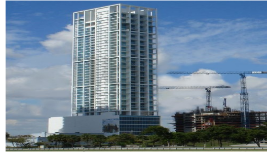
Built in 2007 - 200 units - 48 floors