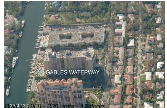
Built in 1969 - 330 units - 13 floors