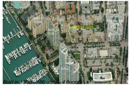
Built in 1996 - 186 units - 4 floors

MLS Number: A11551056 Status: Active Size: 1,410 Sq ft. Bedrooms: 3 Full Bathrooms: 2 Half Bathrooms: Parking Spaces: 2 Or More Spaces, Guest Parking, Parking-Under Building View: List Price: $1,349,000 List PPSF: $957 Valuated Price: $1,207,000 Valuated PPSF: $856