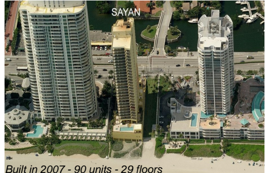
Built in 2007 - 90 units - 29 floors