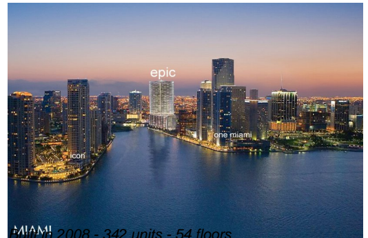
MIAMI: 2008 - 342 units - 54 floors