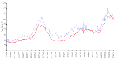
Tower of Quayside 4 vs Miami Shores