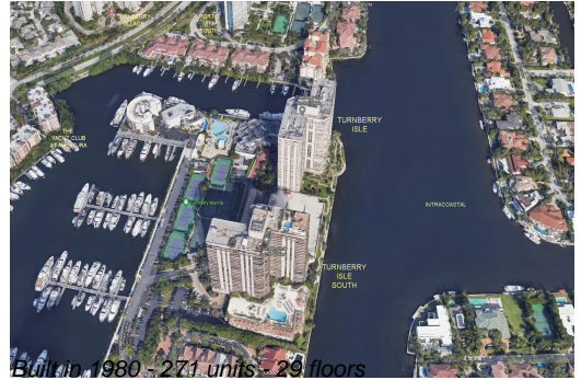
Building 1980 - 271 units - 29 floors