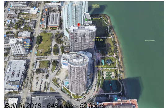
Built in 2018 - 648 units - 52 floors