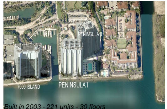
Built in 2003 - 221 units - 30 floors