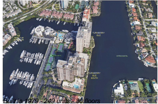
Building 1979 - 249 units - 30 floors