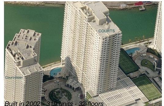
Built in 2002 - 319 units - 32 floors