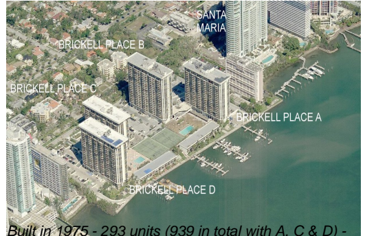
Built in 1975 - 293 units (939 in total with A, C & D) - 26 floors