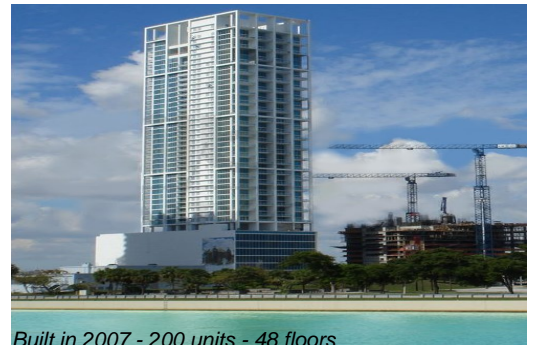
Built in 2007 - 200 units - 48 floors