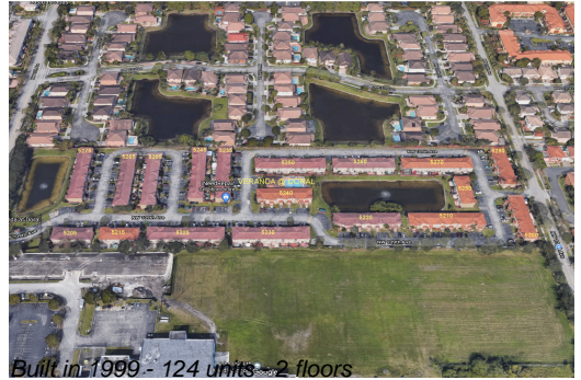
Built in 1999 - 124 units - 2 floors