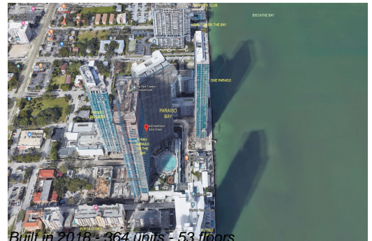
Built in 2018 - 364 units - 53 floors