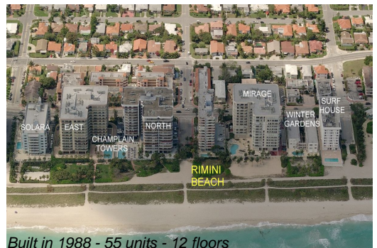
Built in 1988 - 55 units - 12 floors