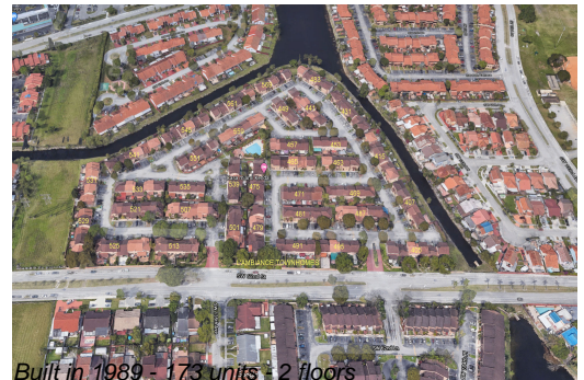
Built in 1989 - 173 units - 2 floors