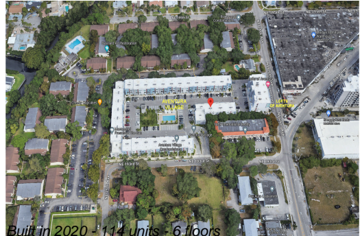
Built in 2020 - 114 units - 6 floors