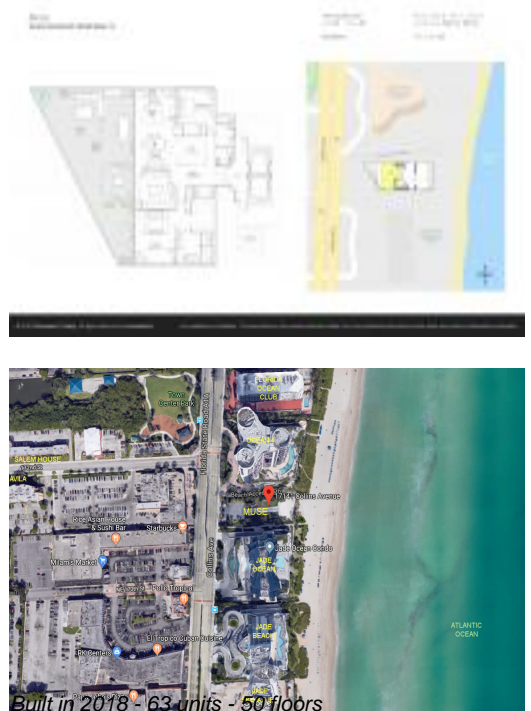
Built in 2018 - 63 units - 50 floors