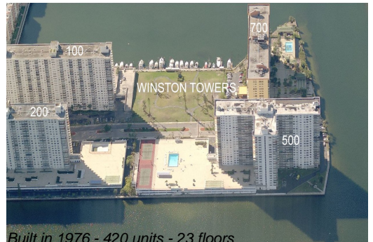
Built in 1976 - 420 units - 23 floors